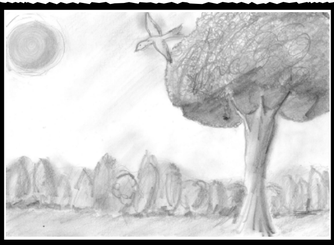
Looking across the field (Isobel, 13)

I think we can all agree, this is a super picture of Ben and his Dad. You can almost see the ball moving.